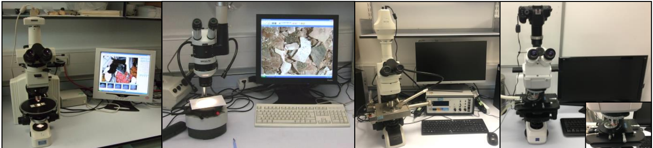
Nikon Eclipse E600 Pol